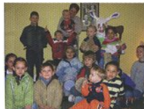
Easter Bunny and all his little helpers.